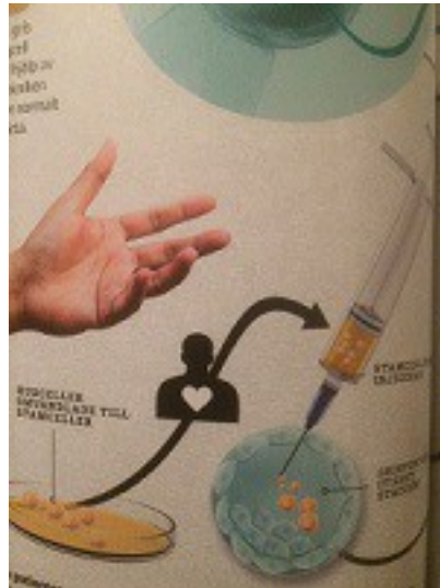
Figure 3: Human stamsel injected into a young pig fetus.