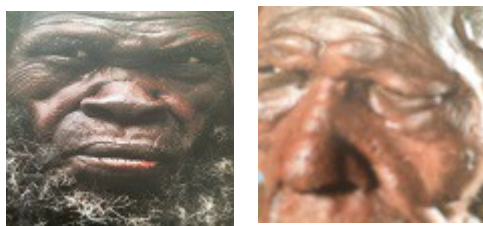
Figure 4: The first human Prophet Adam is estimated to have lived 236,000 years ago from Africa.

Where the descendants of the Prophet Adam have a large brain size, flat face, small teeth and stand upright.