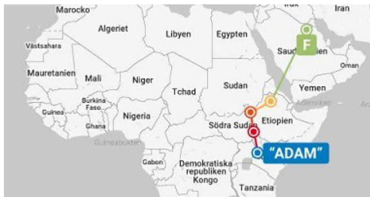
Figure 2: The origin of the Prophet Adam and his wife around the Lake Victoria area (familytreeDNA)