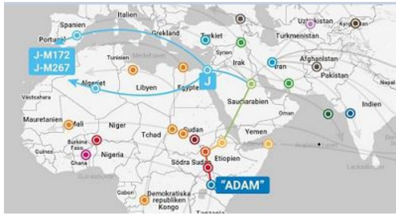
Figure 4: Jews, haplogroup J, from the border between Saudi Arabia and Jordan into Egypt and into Iraq.

Now it has been revealed that Noah has emigrated to Iraq and his descendants are Sam, Ham, Jafits and Qanaan. Then from Sam was born his descendants who sent down the Prophet Ibrahim.