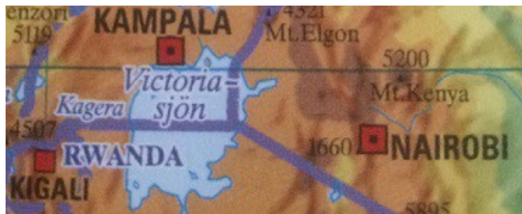
Figure 3: Near Lake Victoria the prophet Adam and his wife started life and sent down their descendants throughout the world.

The first human Prophet Adam is estimated to have lived 236,000 years ago. Where the descendants of the Prophet Adam have a large brain size, flat face, small teeth and stand upright. So now the secret behind the verse has been revealed: "... We say: "Come down! Some of you are enemies to others, and for you there is a dwelling place on earth..." (Al Baqarah: 2:36)