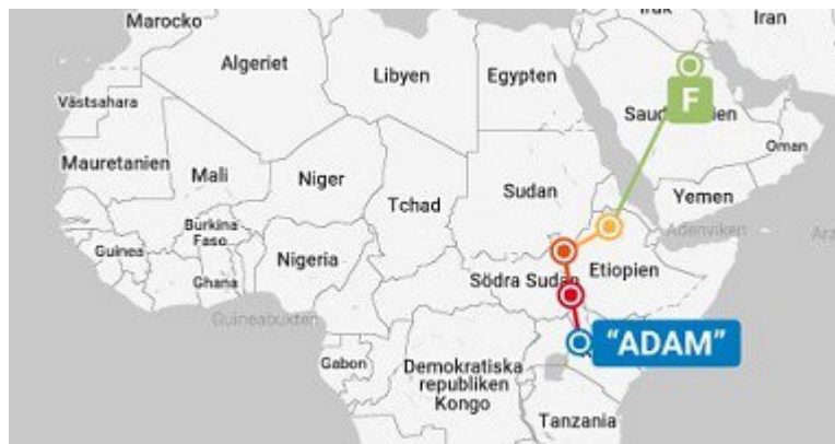
Picture 2: Prophet Adam and his wife came out of heaven and settled in the Lake Victoria area